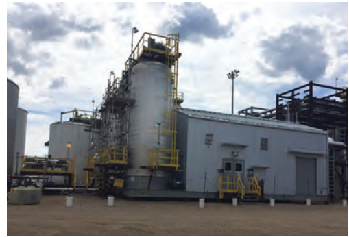
SAGD Sulfur Recovery Unit

PureChem Services provides H 2 S sweetening equipment to meet your specific needs. Sizing ranges from large custom build SAGD sulfur recovery units capable of removing multiple tonnes of sulfur a day down to stock 36" and 24" flooded tower systems suited for batteries.