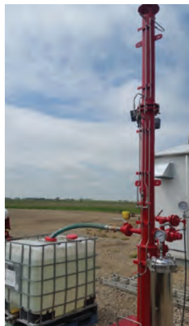
Counter Current Scrubber

PureChem Services offers both traditional tank vent scrubbers and counter current scrubbers suitable for when a low pressure sweetening solution is required.